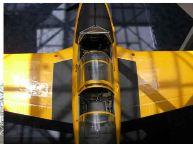
Naval Air Museum in Pensacola